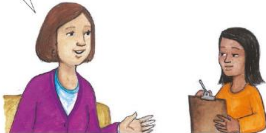
Source 2: Study & Master Grade 4 Social Sciences Learner's Book, page 102

I went to a school for white children. Our teachers encouraged us to work hard so we could get good jobs one day. We lived in a white suburb with a big garden and a swimming pool.